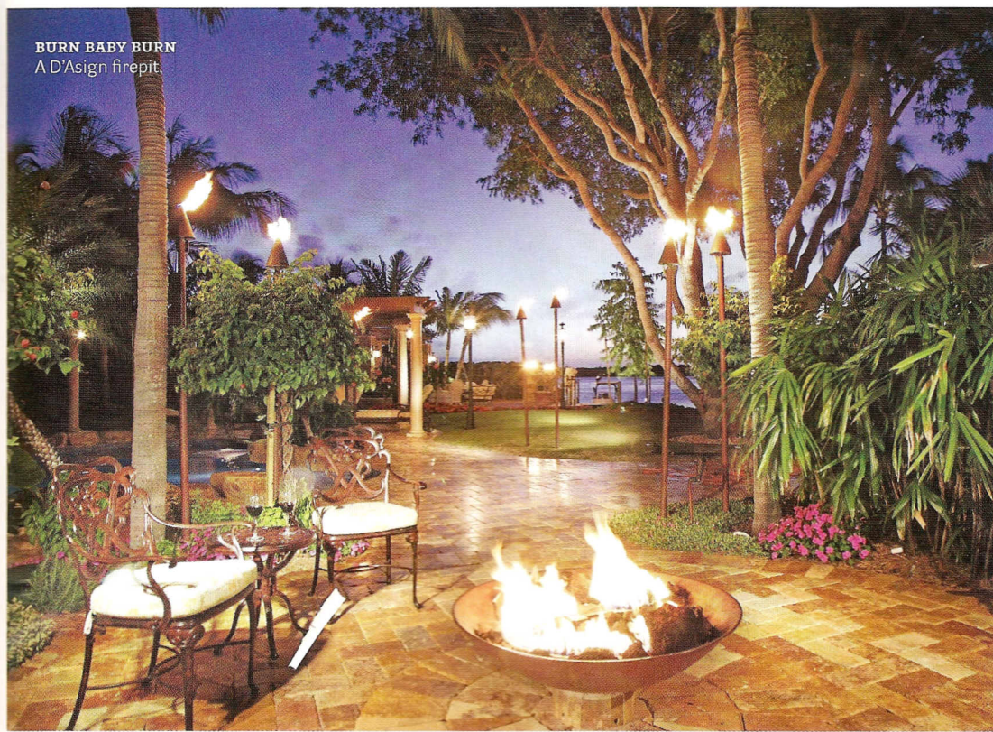
BURN BABY BURN A D'Asign firepit.

D'Asign Source also owns Coastal Source, which specializes in building raw materials for coastal products. The two companies work together in creating products that can stand up to the harsh weather conditions common along the ocean. "We've invested in salt and heat test chambers to do thorough tests to accelerate corrosion on our products," says D'Ascanio. "We go to extreme lengths to find superior products." 305-743-7130, dasignsource.com . —Jillian Ducharme